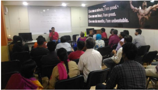
CHENNAI WORKING COMMITTEE MEET

Thanks to all the volunteers who have attended the meet and made this event a successful one.