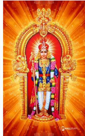
LORD PAZHANI MURUGA