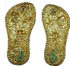
MURUGA PERUMAN'S THIRUVADI