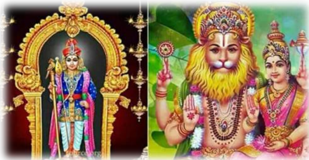
LORD PAZHANI MURUGA

LMRK, through the grace of Muruga Peruman